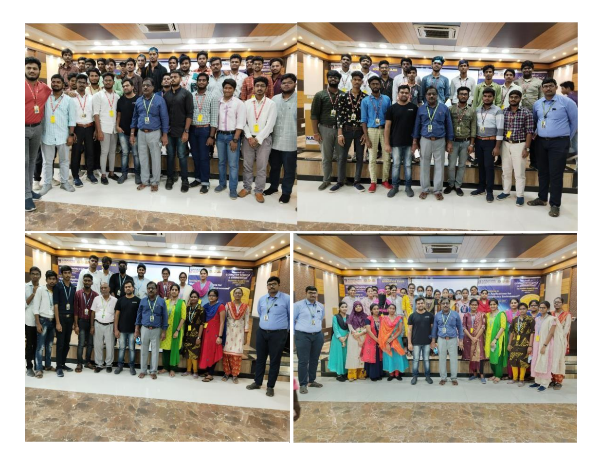
Glimpse of Day1:Session 1